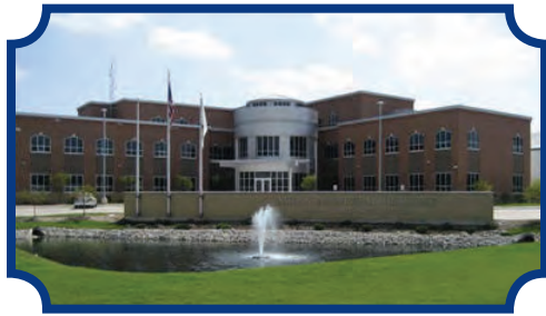
Respecting the Past ~ Looking to the Future

For a map of daily traffic counts visit the Illinois Department of Transportation at www.gettingaroundillinois.com or Bi-State Regional Commission at www.bistateonline.org/map_pub/map.shtml (February 2010).